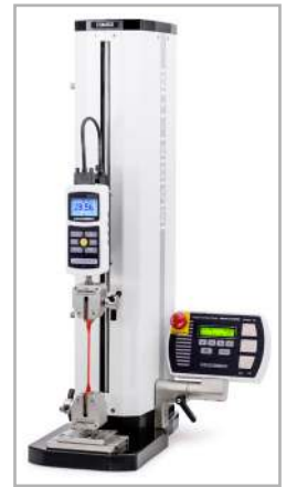
Shown with an ESM303 test stand and G1061 wedge grips

Series 7 force gauges are directly compatible with Mark-10 motorized test stands, to permit functions such as break testing, tensile testing, compression testing, dynamic load holding, PC control capability, and many other applications.